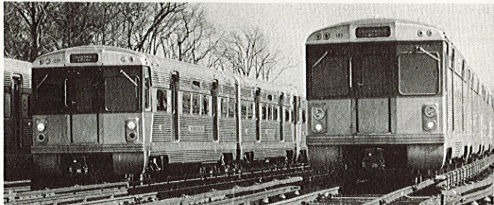
Pittsburgh groups are pushing for construction of a high-speed rail system like the Lindenwold line pictured here, instead of a busway on railroad right-of-way.

If elected, Stokes and Hunt promise to force PAT to design a medium-density rail system which can be completed faster and at less cost.