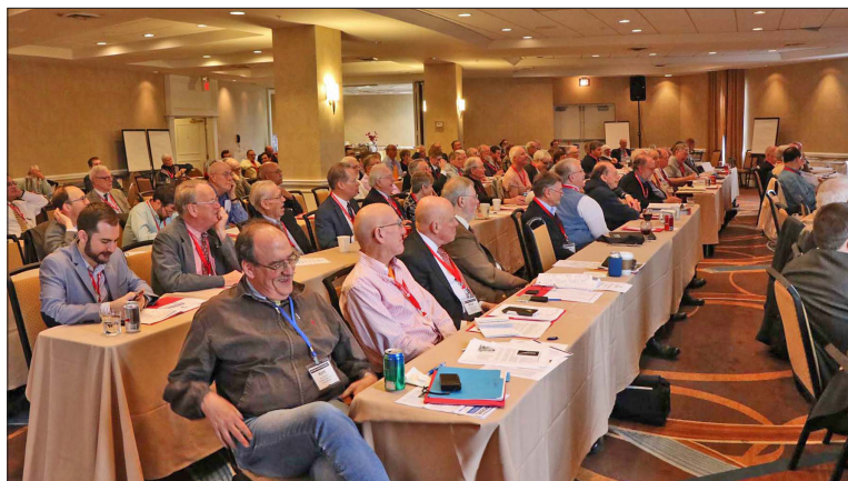
NARP Council members attend meeting.

The Council consists of 112 elected state representatives.