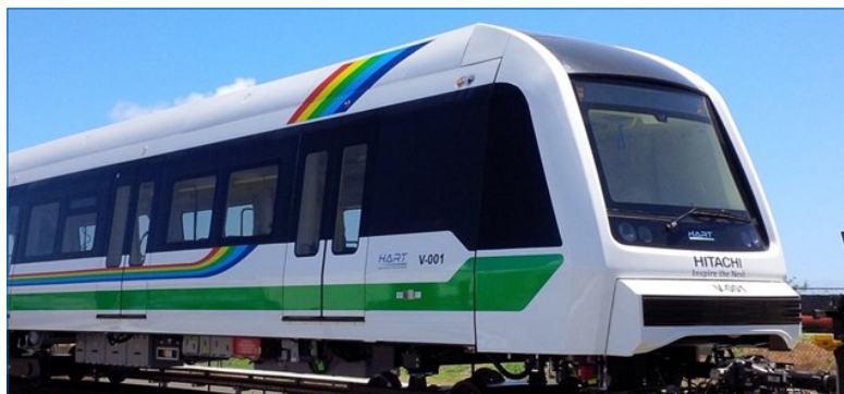
A Honolulu Area Rapid Transit train

However, the proposed cuts to Amtrak won't be put to rest until the Senate goes through the amendment process and a long-term funding solution is reached. For 2017, Congress passed a three-month Continuing Resolution to keep the government funded through December 8, so Senate action will likely happen later this fall. Get all the latest updates online at www.narprail.org . ■