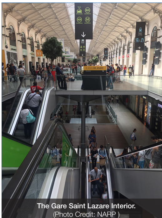
The Gare Saint Lazare Interior.

Surely, many members have at least seen photographs of the impressive glass and steel canopies of China’s new high speed rail system, arching gracefully hundreds of feet above dozens of tracks. Or perhaps renderings of urban planning projects in Morocco and Taiwan