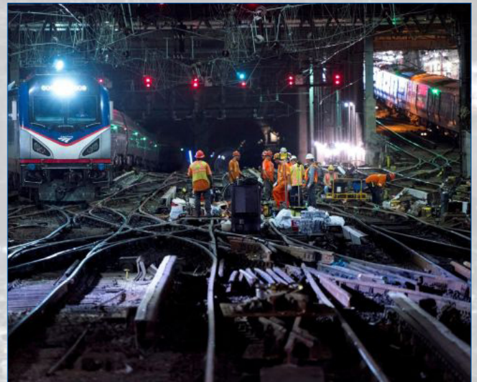
Amtrak employees work on the tracks at Penn Station’s A Interlocking.

One critical project that Amtrak will tackle before the year’s end, although not directly related to the rail infrastructure, is cleaning and upgrading the bathrooms at Penn Station. Moorman said in September that Amtrak has already hired a contractor to deal with the restrooms, which some commuters say are unacceptable. To complete upgrades to the restrooms, Amtrak will have to bring in temporary bathrooms while work is being conducted. ■