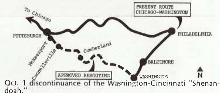
Oct. 1 discontinuance of the Washington-Cincinnati "Shenandoah."

Work is proceeding on schedule for the Oct. 1 rerouting of the Washington section of the Washington/New York-Chicago "Broadway Limited." Earlier this year, Amtrak's Board of Directors approved $2.3 million in track and station work to permit rerouting the train from its present circuitous route via Philadelphia onto a direct route via Cumberland, MD. The rerouting should cut at least 2 hours off the train's present Washington-Pittsburgh running time and will mean continued Amtrak service to Cumberland, which otherwise would have lost all service with the