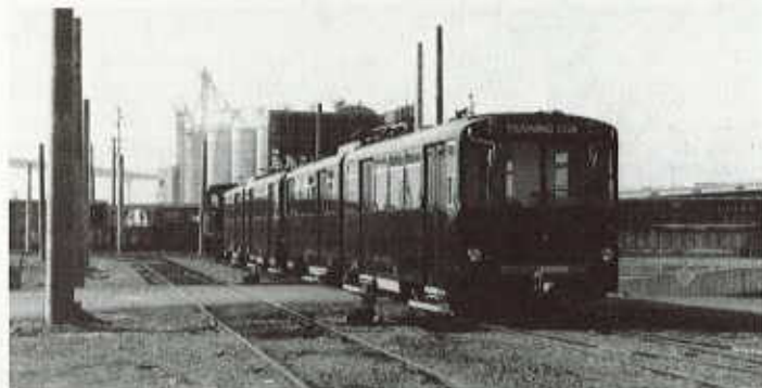
Two of San Diego's trolley cars, purchased for $800,000 a piece. In this March 1981 photo, catenary wires were not yet strung, and cars' power pantographs were in lowered position.

Oddly enough, a 1976 tropical storm helped bring about San Diego's trolley revival. The storm caused so much damage to the 109-mile SD&AE that its owner, the Southern Pacific Railroad, decided to abandon it. San Diego officials, concerned over the loss of freight service and increasingly conscious of the line's transit potential, offered to purchase the single-track line for $18 million if Southern Pacific would repair all storm damage. SP agreed, and San Diego got itself a railroad. San Diego's Metro-