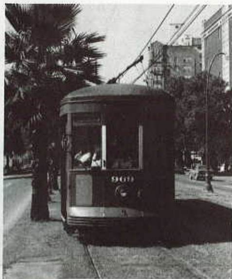
New Orleans' St. Charles Avenue Streetcar, one of the few survivors of the transit conspiracy.

The transcript reveals that GM and its fellow highway/oil conspirators were anxious to get Americans out of electric trolleys and streetcars—and into oil-consuming cars and buses. Finding that cities were unwilling to give up their rail systems voluntarily, the corporations schemed to buy the systems, junk them, and replace them with GM and Mack buses—in some cases, almost overnight. GM and its accom-