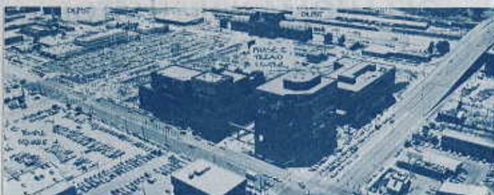
Triad Center Phase I under construction in foreground and to left as seen from the roof of the U.P. station (top photo). Downtown is at right, further east. Photo below, looking southwest from just east of Phase I as it appeared in 1983, its proximity to the U.P. station and distance from the D&RGW are illustrated.