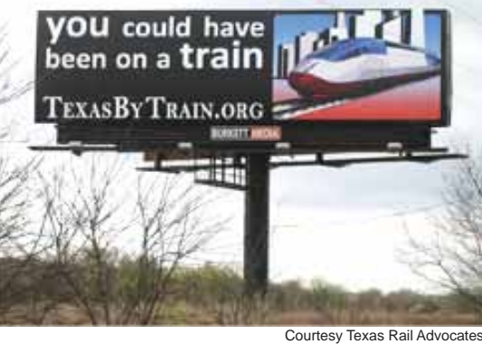
Billboard seen along I-35 near Austin.

Legislation to capitalize the Rail Relocation and Improvement Fund passed earlier, but the money was never appropriated after the State Comptroller and the Attorney General's office disagreed over the bill's wording.