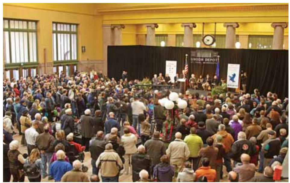
Ramsey County (Minn.) Regional Rail Authority

Well-attended ceremony marks completion of $243 million restoration