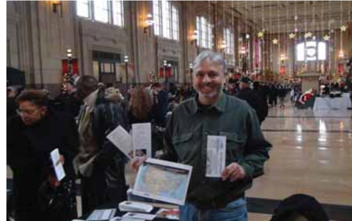
Amtrak Saved from Sandy's Worst