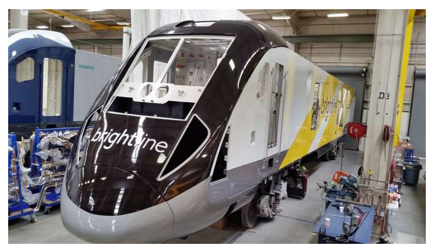
View of a Brightline locomotive under construction at the Siemens plant in Sacramento.

The long-sought addition of an 18-mile second main track between Albany and Schenectady, NY, is now underway. Amtrak's automated Track Laying Machine (TLM) started on the installation of new cement ties and welded rail. This segment of the Empire Corridor, which sees twelve passengers trains a day, has been a major choke point for over 25 years and has often contributed to significant delays. The new second track will have a top speed of 110mph when it enters service in 2017. This project is one of several improvements in progress across NY's Capital Region.